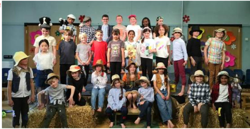
Year 3 and 4 play