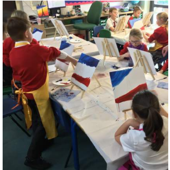
Buttercup Class produced some stunning silhouettes of Big Ben and the Eiffel Tower set against a beautiful bright sky.